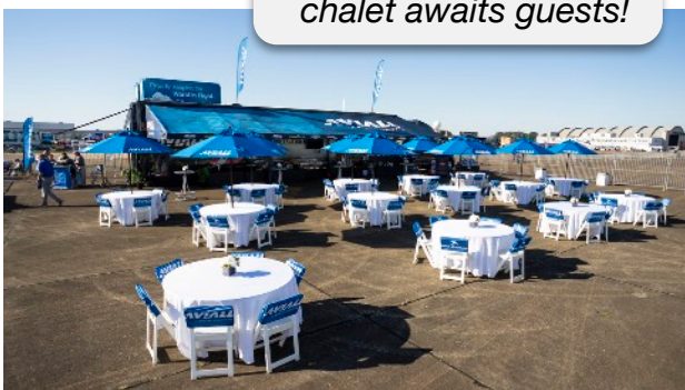
Fully branded Aviall chalet awaits guests!